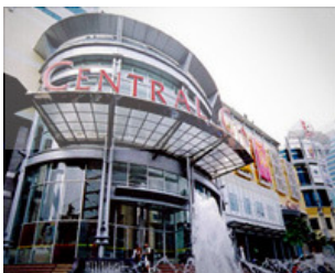
Central Plaza Bangna

G Floor, Central Plaza Bangna Shopping Complex, Bangkok